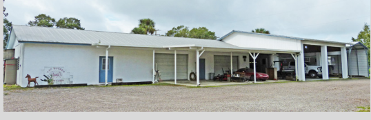
Shop / Offices / Garage

Unique Horse & Hobby Property with 2BR Home and Versatile Shop Zoning: AG - 2.5 Agricultural - Commercial